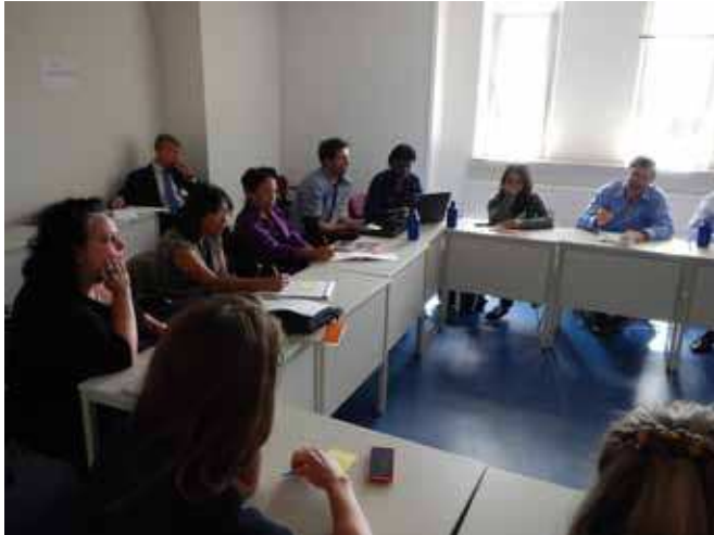
Force, Fraud and Coercion track participants.

early 1990s. Of particular emphasis in this early phase of track discourse were (I) Cambodia, (II) South Korea, (III) African Countries, and (IV) India with highlights discussed below.